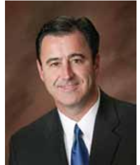
Mayor Michael Mignogna

Voorhees is proud to be in the center of everything...and away from it all.