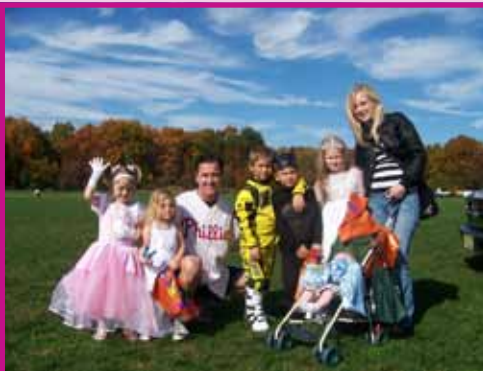
Voorhees Mayor Michael Mignogna stops to greet trick-or-treaters just after the Children's Halloween Parade.