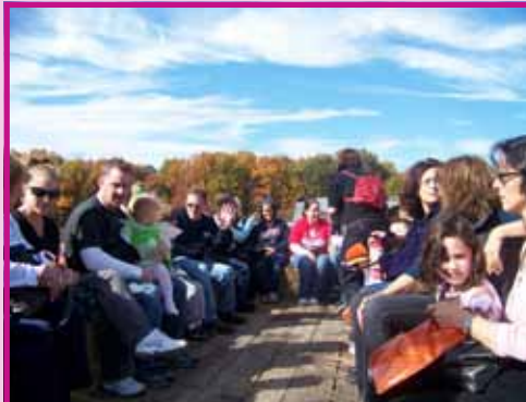
Children enjoyed taking an old-fashioned hayride and picking pumpkins on a crisp October day.