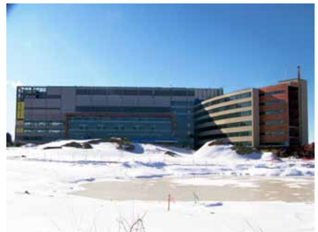
With the new Virtua Hospital building now enclosed, inside construction work can continue through the winter months.

The new facility is also projected to have 2,800 employees by the campus' completion. When the medical campus is fully operational, the total number of employees could increase to 4,000.